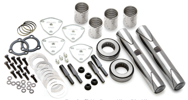
FastSet™ No Ream King Pin Kits